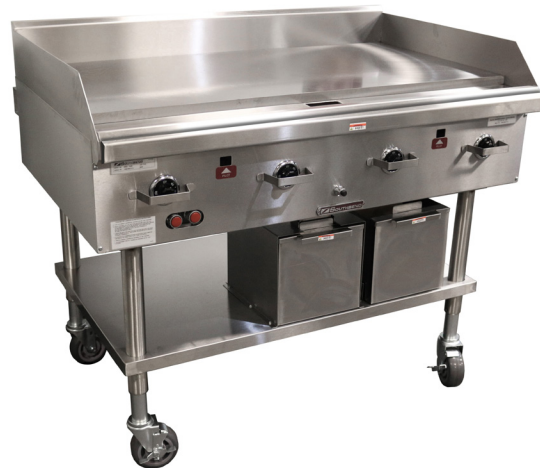
Model shown HDG-48V