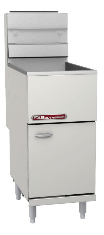
Model shown SB35S