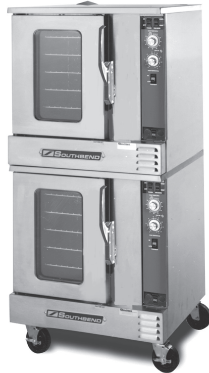
(shown with optional casters)

150°F to 550°F temperature controller with 140°F to 200°F "Hold" thermostat. Dual digital display shows time and temperature. A fan cycle timer pulses the fan.