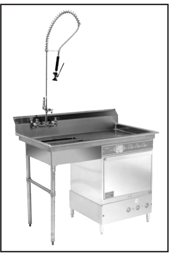
Optional dishtable and Pre-wash.