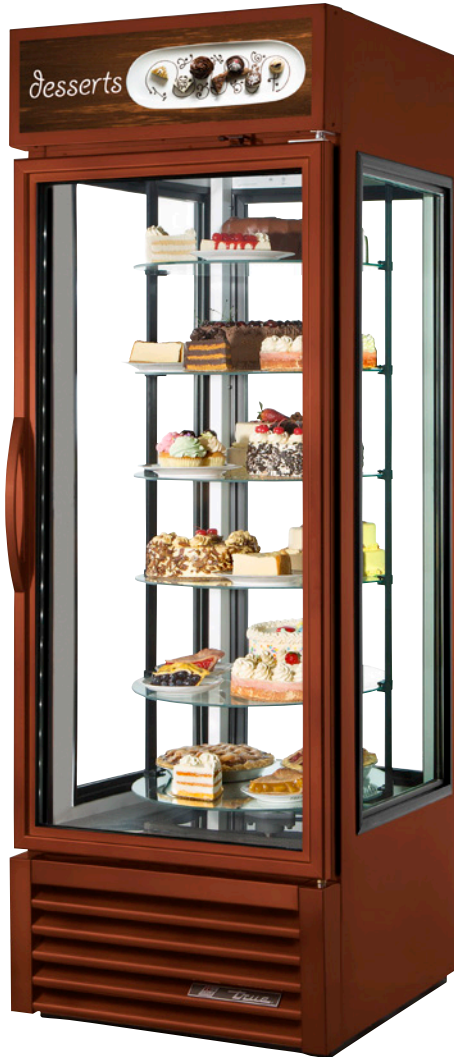
Shown with optional Dessert Sign.