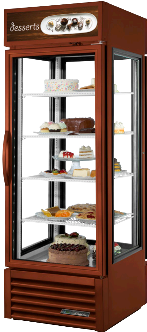
Shown with optional Dessert Sign.

Swing Door Pass-Thru Refrigerator with Hydrocarbon Refrigerant-True Standard Look Version 01