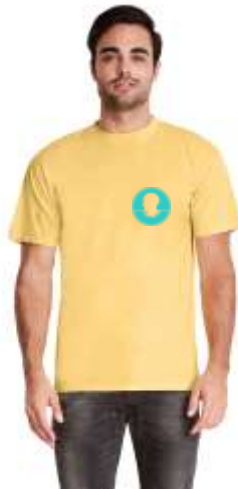
SHORT SLEEVE (SSC)