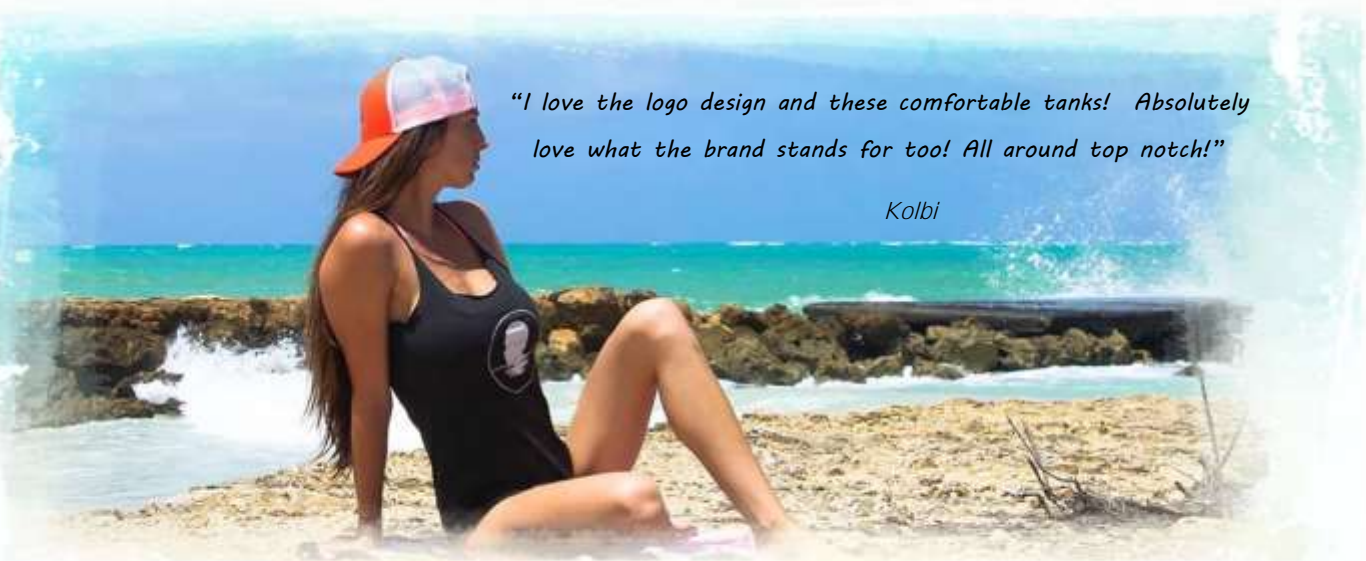
"I love the logo design and these comfortable tanks! Absolutely love what the brand stands for too! All around top notch!"