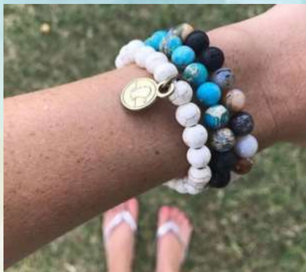
"Loving the Beach Bracelets and The Beach Oil! The scent calms me and reminds me of vacationing at the beach!" Mary