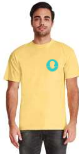
SHORT SLEEVE POCKET (SSP)