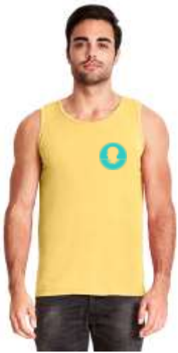
MUSCLE TANK (MT)

Colors: Sun, Seagrass, Peri-Blue, Lead, Ocean, Paprika, Guava, Denim, Wine