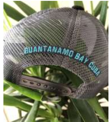
OPTIONAL NAME DROP