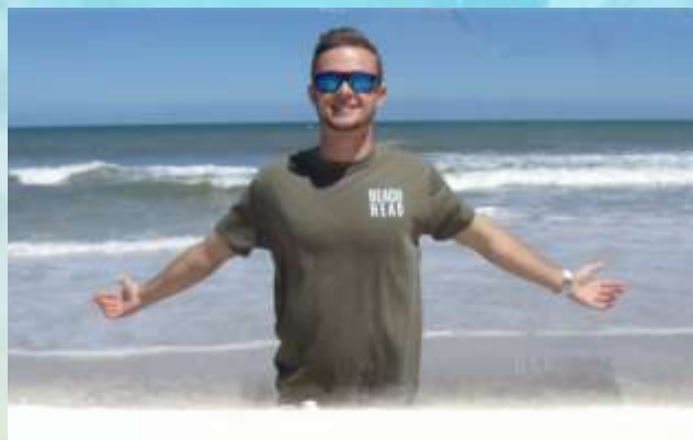
"Softest shirts ever! This one's my favorite!"