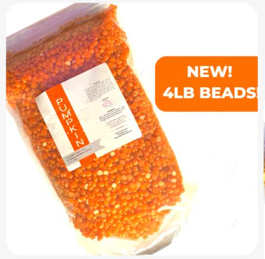
Pumpkin Polymer 4lb Bag of Beads