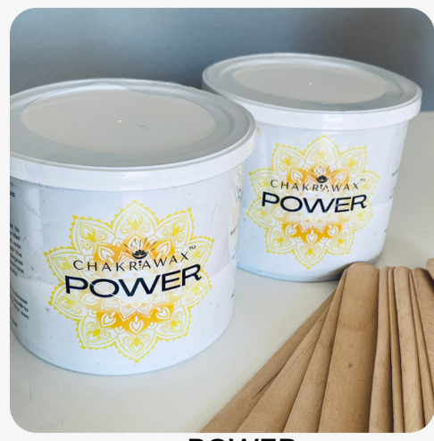
POWER Strip Wax

Great waxing starts with great technique. Combine that with great product and you've got a no fail start to a booming brow and Brazilian business.