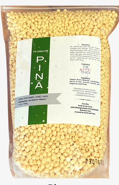
Pina Non-Polymer Hard Wax