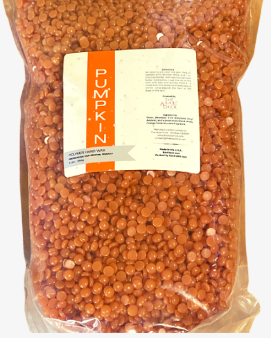
Pumpkin Polymer Hard Wax