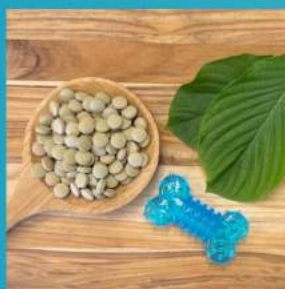
PET KRATOM TABLETS