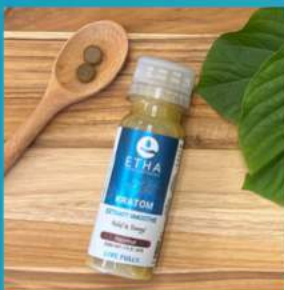
KRATOM EXTRACT TABLETS & DRINKS