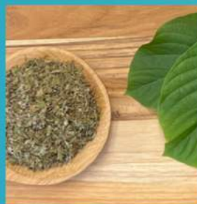
KRATOM LOOSE LEAF & TEA BAGS