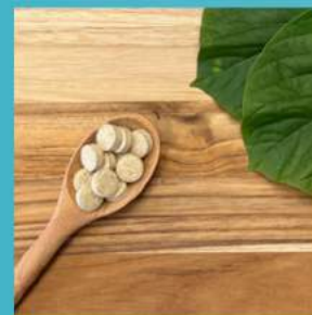
KAVA & TONGKAT ALI TABLETS