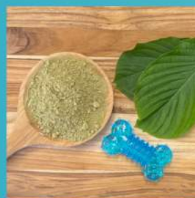
PET KRATOM FOOD TOPPERS