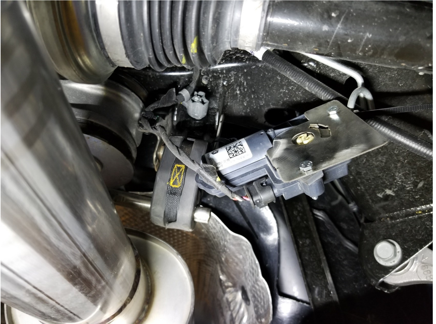
Passenger side example Figure 6

STEP 5: Plug the AFM/ dual mode exhaust valve to the factory harness, retain valve in a safe location where it is not going to contact any moving parts. No tuning is required. Time for a test drive!