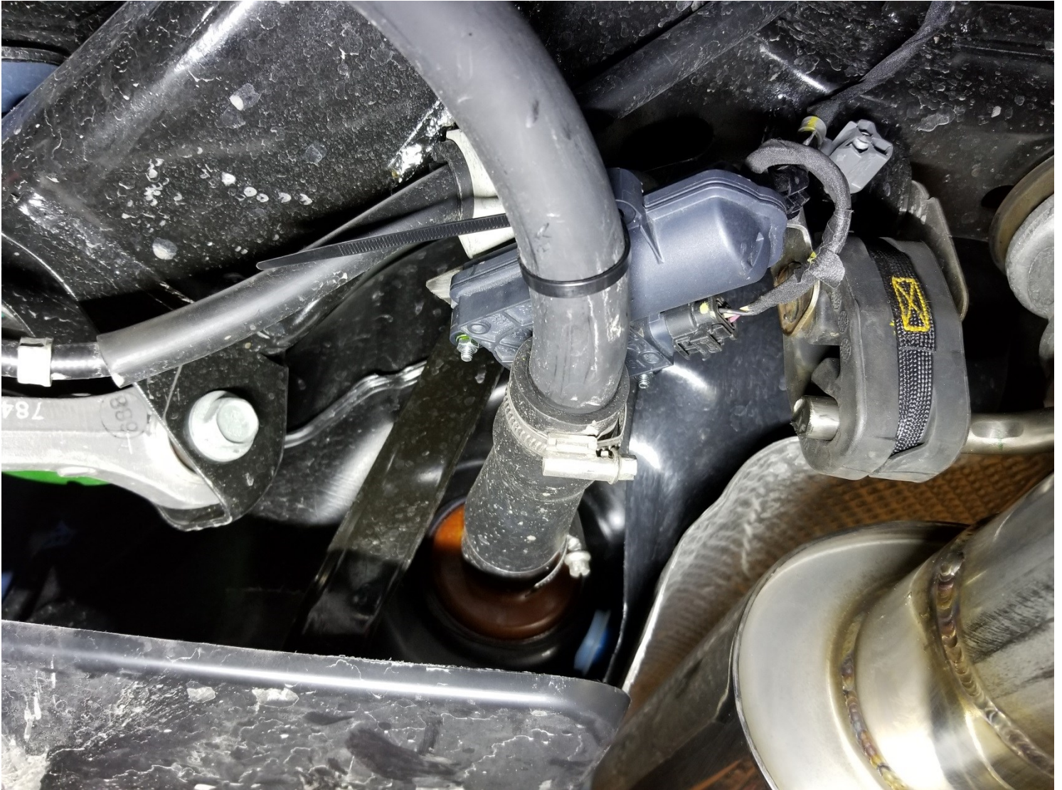
Drivers side example figure 5