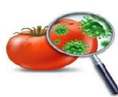
GMO &amp; Food Safety