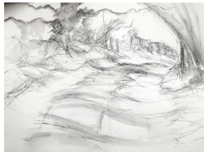
Mapping out the picture structure

I have always been inspired by my daily walks around the footpaths, bridleways and lanes in my village. I look for the way the lane disappears around a corner, the vanishing trick that makes you want to know where the lane goes. I am also fascinated by the surface of lanes and how rutted sections tip and tilt in different directions. I make very quick sketches while I am walking and take photos and short videos to remind me of the details.