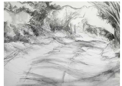
Adding washes of tone