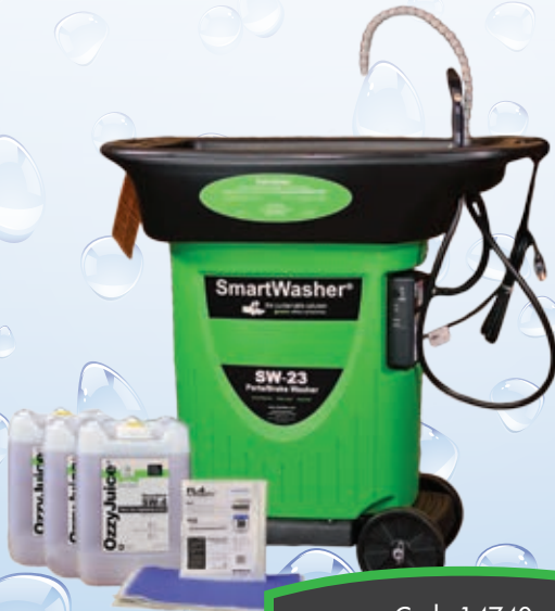
Code 14740 SW-423 Mobile Parts Washer Kit

(1x SW23 unit + 3 Pails SW4 Fluid + 1x FL 4 Filter)