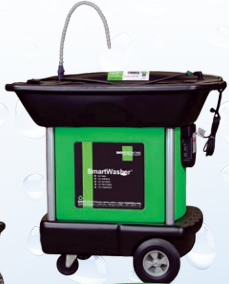
Code 14741 SW-437 Mobile Heavy Weight Parts Washer Kit

(1x SW23 unit + 3 Pails SW4 Fluid + 1x FL 4 Filter)