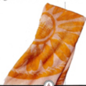
4 Tory Burch