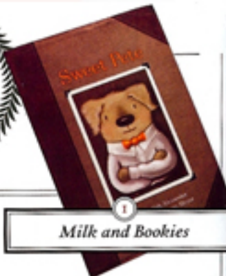
1 Milk and Bookies

They say it's better to give than to receive. That may be up for debate, but there is a certain pride in finding gifts that combine the joy of giving with the higher purpose of giving back.