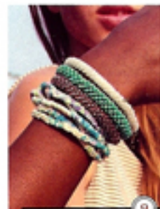
9 Same Sky