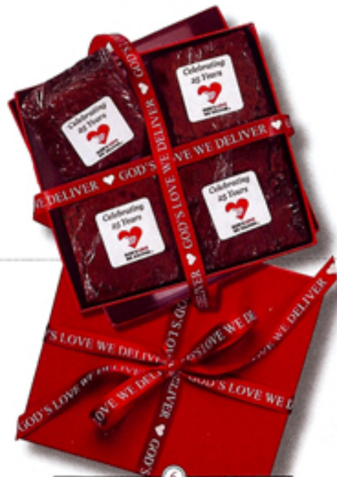
6 God's Love We Deliver