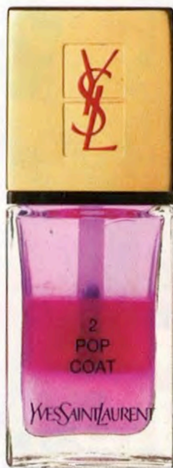
YSL La Laque Couture Tie & Dye #2 in Pop Coat, $25, bloomingdales.com

The purpose of this gorgeous, glamorous parfait-of-a-nail-polish shade is beauty and silliness. It leaves a chic sheer pink on your nails, but the joy of it is sitting by a pool with a stack of magazines, something cool to drink and nothing to do but dab at your toes with the brush from this, the prettiest nail polish ever devised.