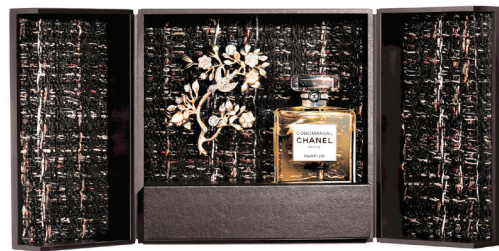
46 APPLY SCENT FROM A BACCARAT FLACON... CHANEL COROMANDEL AND MAISONS D'ART COFFRET ($10,000), CHANEL.COM