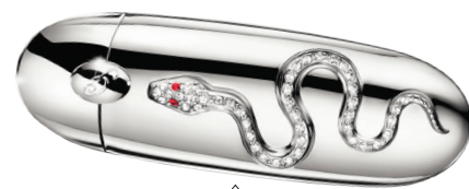
45 PULL OUT YOUR LIPSTICK IN THIS... GUERLAIN ROUGE G WILD GLAM CASE ($290), GUERLAIN.COM