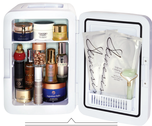
44 STOCK AN INSTA-FAMOUS BEAUTY FRIDGE... COOLULI INFINITY 10-L FRIDGE ($80), COOLULI.COM. FOR BEAUTY PRODUCT INFO SEE PAGE 170