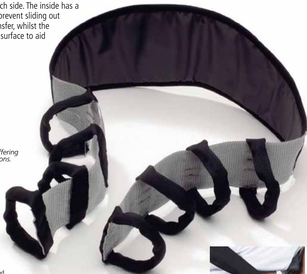
Etac Sling is a flexible tool offering a number of different functions.

Sling has 4 handles on each side. The inside has a non-slip material to help prevent sliding out of position during the transfer, whilst the outside has a low friction surface to aid placement and removal