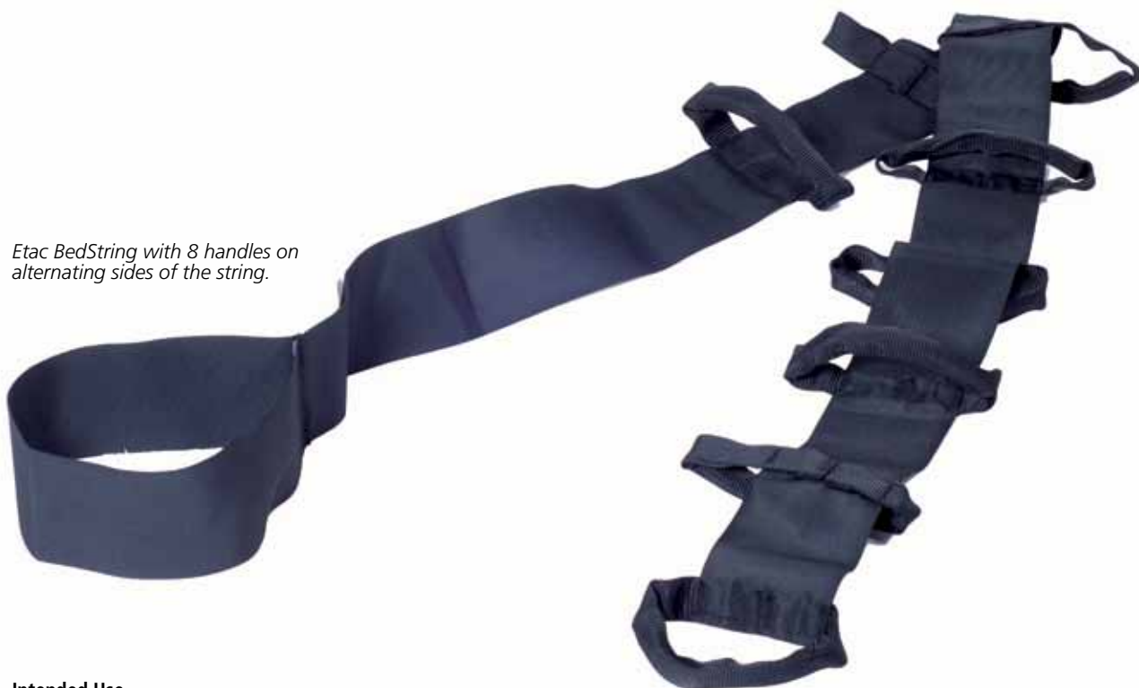
Etac BedString with 8 handles on alternating sides of the string.

BedString has 8 handles, alternating right and left side of the string to enable the user to find a good grip.