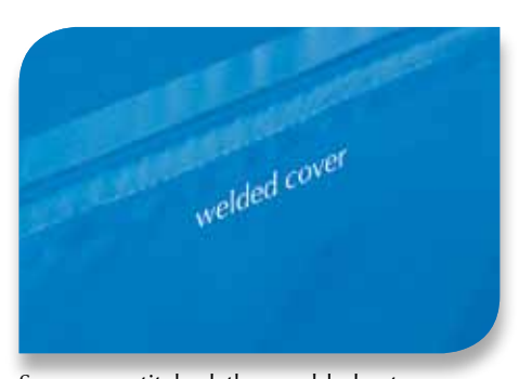
Seams are stitched, then welded or tape sealed for maximum infection control