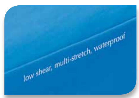
Vapour permeable, bacteriostatically treated, fire retardant and water resistant cover