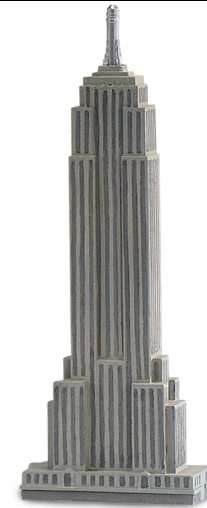
Empire State Building