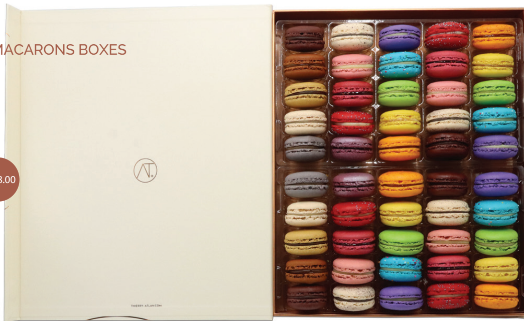
50pc Macarons Lover Box