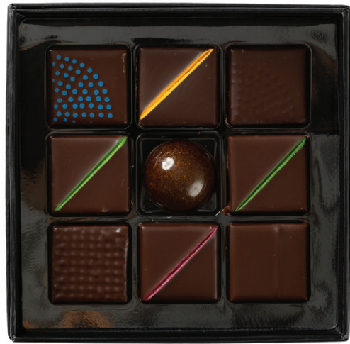
9pc Assorted Chocolate Box