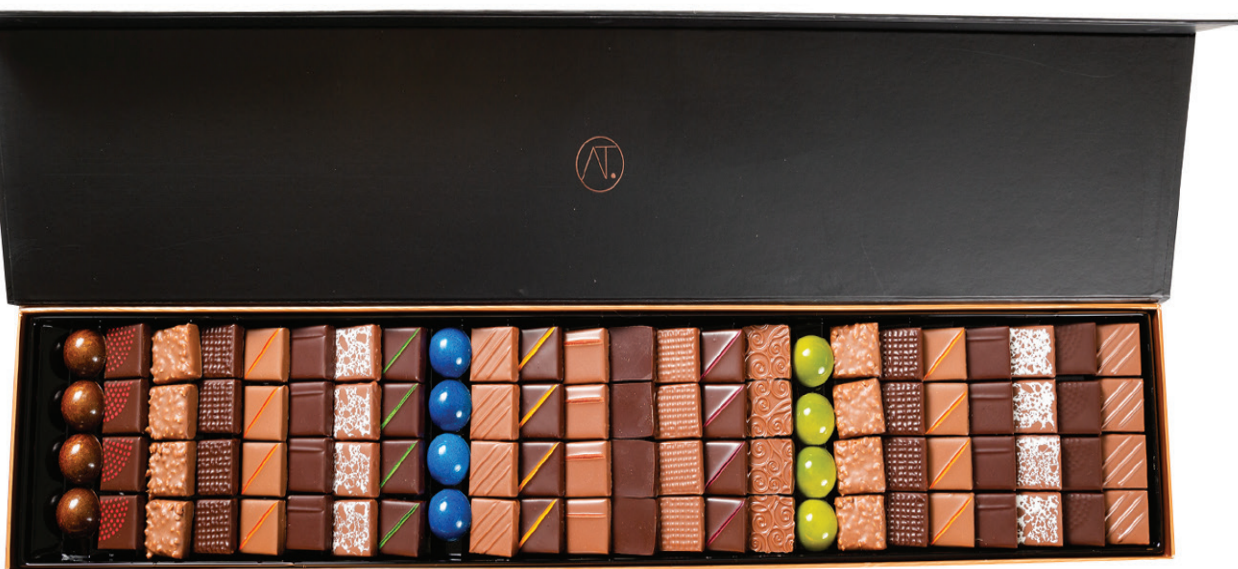
96pc Assorted Chocolate Box