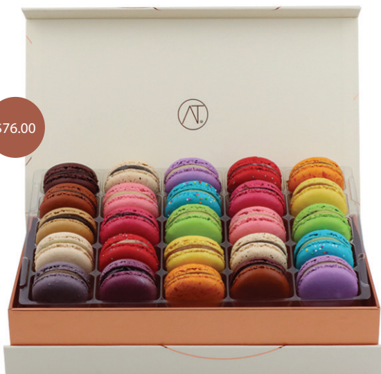
25pc Discovery Box