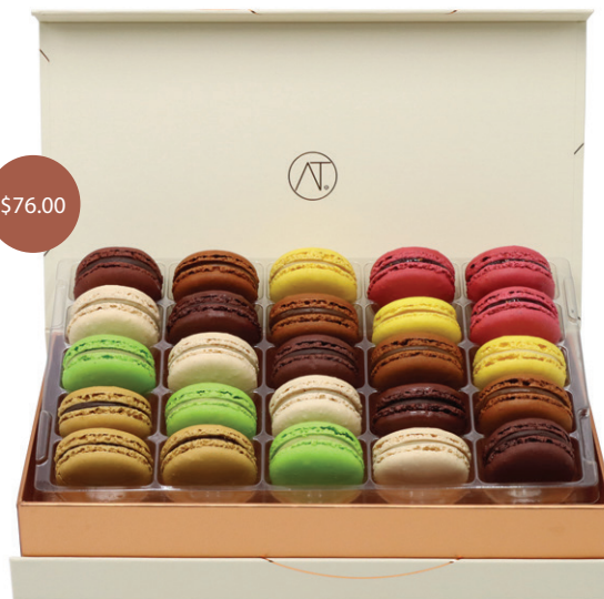
25pc Taste of Paris Box