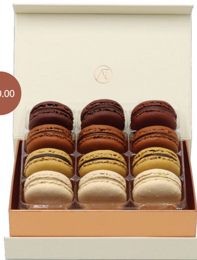
12pc Thierry's Favorites Box