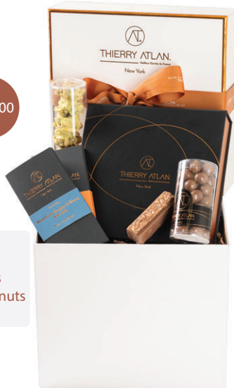
Gift Basket 2