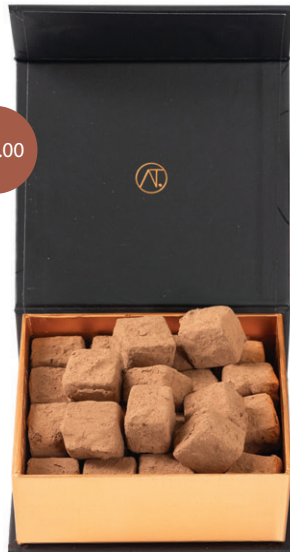
Whiskey Truffle Box