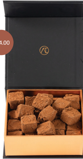
Orange & Grand Marnier Truffle Box