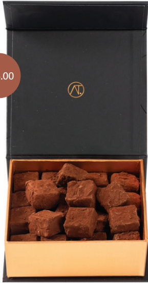
Classic Truffle Box