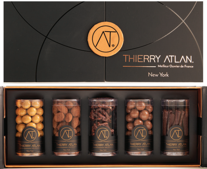
16pc Assorted Caramel Box