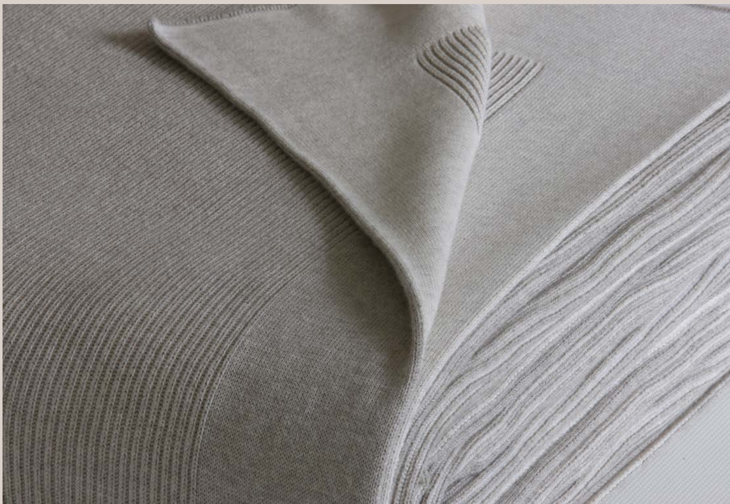
« double sided rib » small box