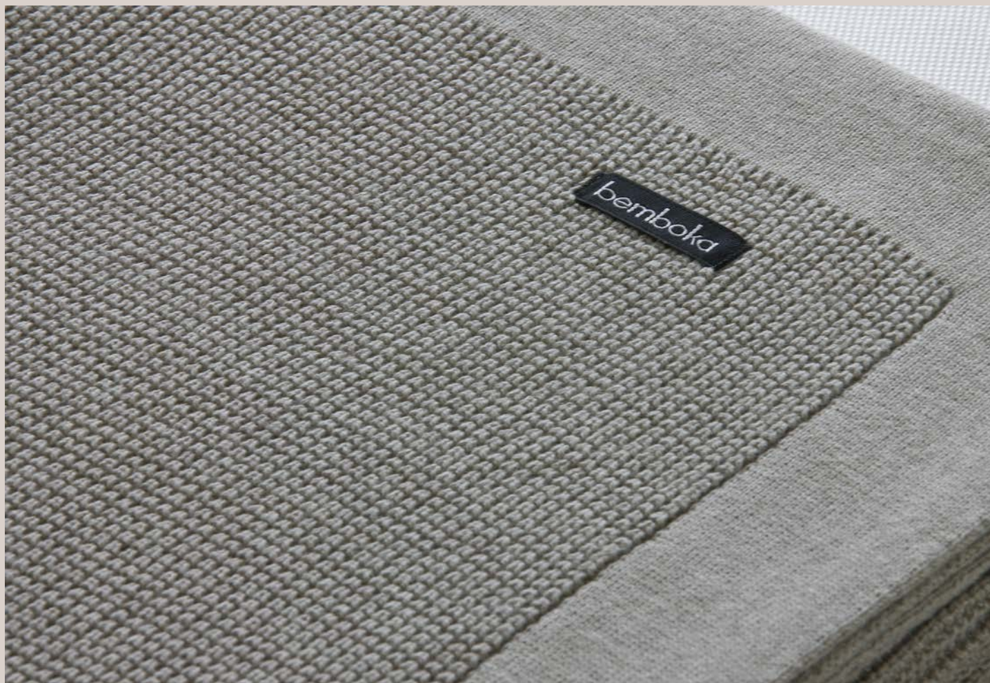
« small box » trieste, moss stitch