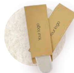
Print Logo on craft paper envelope

Branded and personalised Seedling Sole slippers become the take-home memento for your guests and a reminder of their time with you.