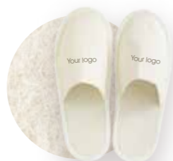
Print Logo on Slipper