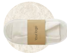
Print Logo on craft paper wrapper