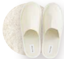
Brand Tag on Slipper

Choose from the following branding options: