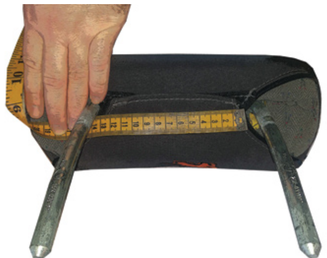
5: Finally we will need the width between the headrest stalks