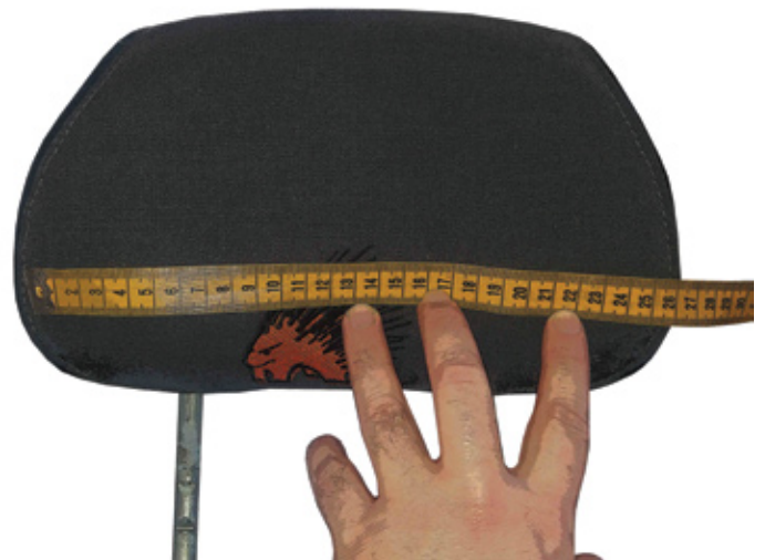
3: The width of the widest part of the headrest (Front or back)