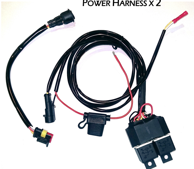
POWER HARNESS X 2