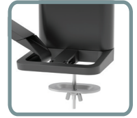
GROMMET 98-492-009 (MATTE BLACK)