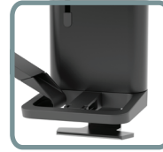
SLIM PROFILE 98-490-224 (MATTE BLACK)