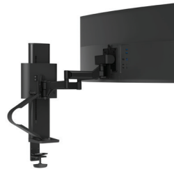
Single with Panel Clamp