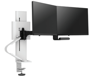
Dual with Panel Clamp