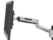
LX Sit-Stand Wall Mount LCD Arm