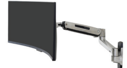
LX HD Sit-Stand Wall Mount LCD Arm