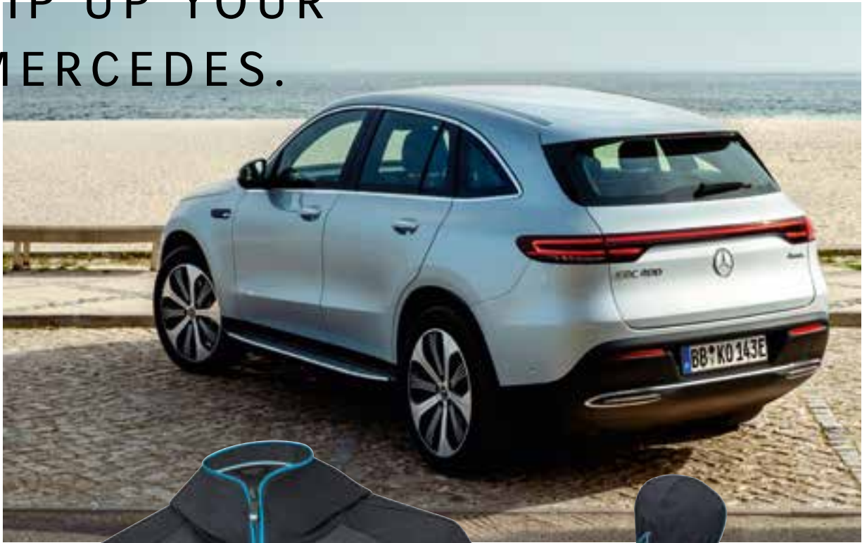
EQC 400 4MATIC: Electrical consumption, combined Average CO 2 emissions 20.8-197 kWh/100 km: 0 g/km