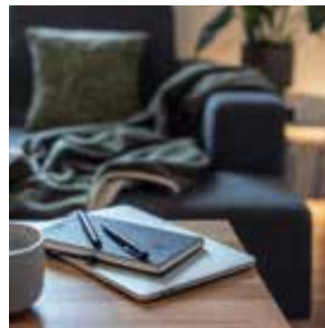
WORK & LIVING 052