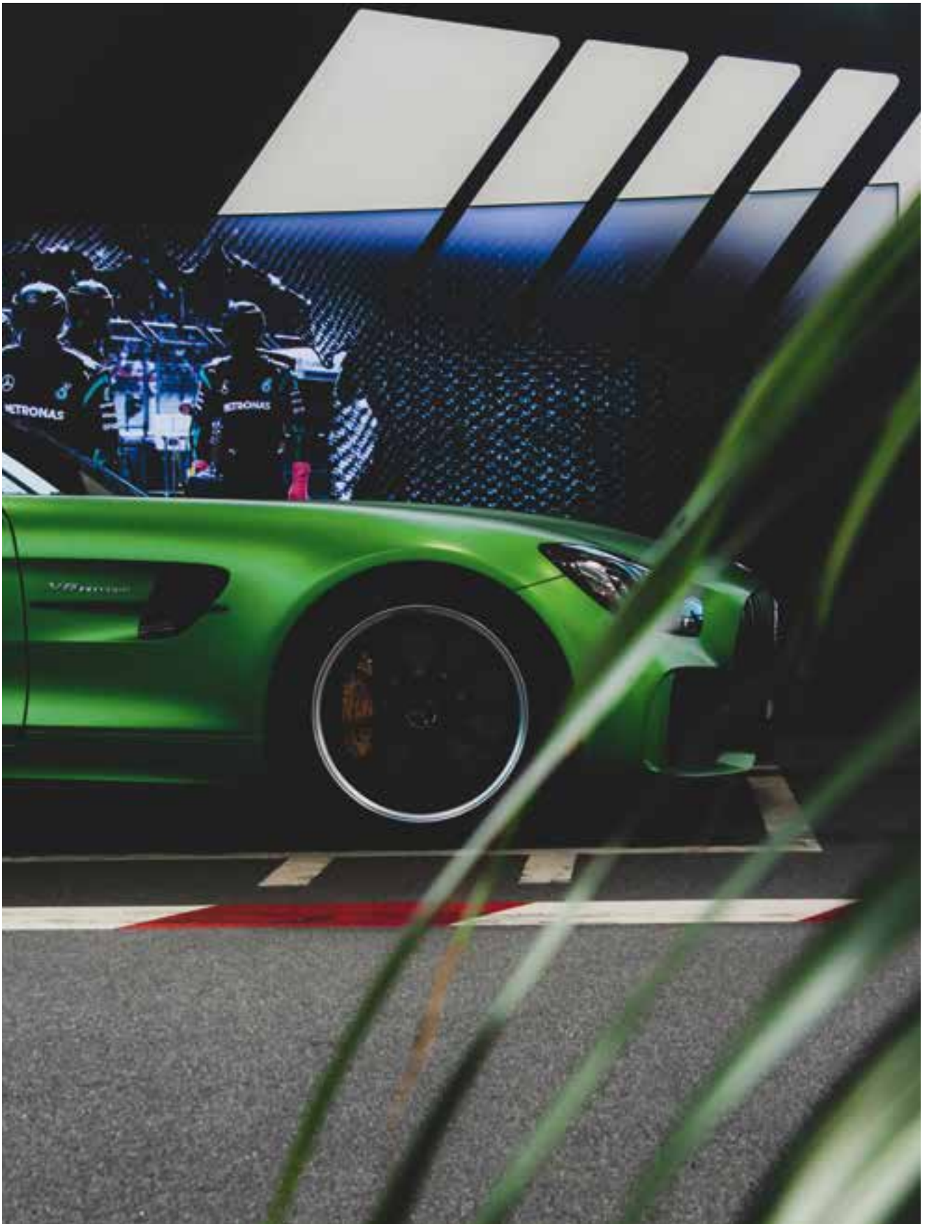
Mercedes-AMG GT R: Combined cycle fuel consumption: 12.4 l/100 km; Average CO 2 emissions: 284 g/km