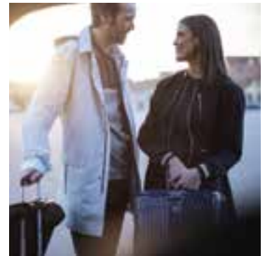
TRAVEL & OUTDOORS 038