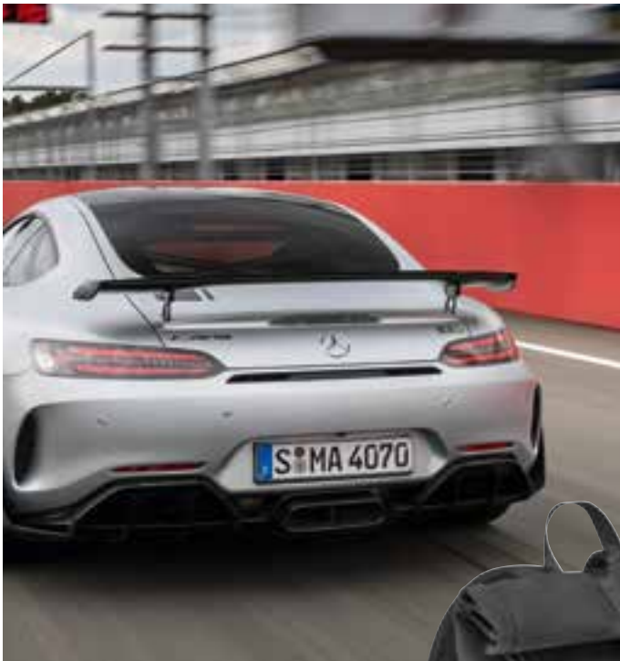
Mercedes-AMG GT R Pro: Combined cycle fuel consumption: 12.4 l/100 km; Average CO 2 emissions: 284 g/km