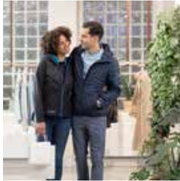
FASHION & BEAUTY 002