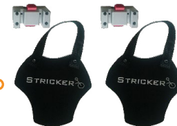
Design Weight Plates