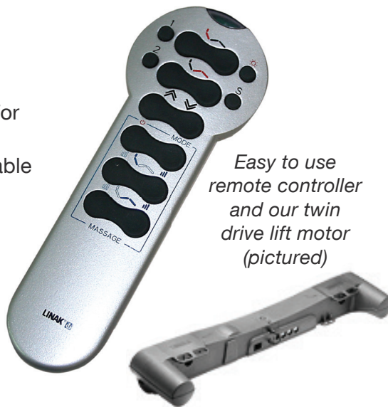
Easy to use remote controller and our twin drive lift motor (pictured)