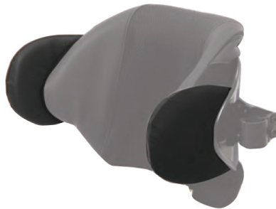
Carbon Fibre Hardware