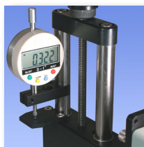
Digital travel indicator