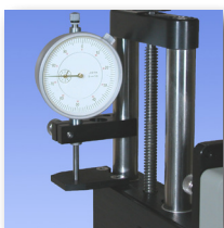
Dial travel indicator