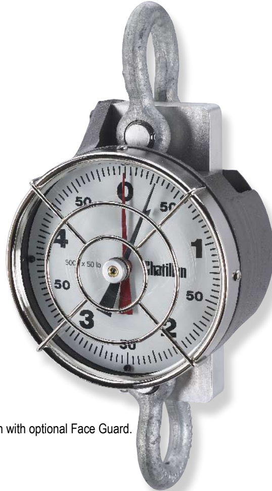
Shown with optional Face Guard.