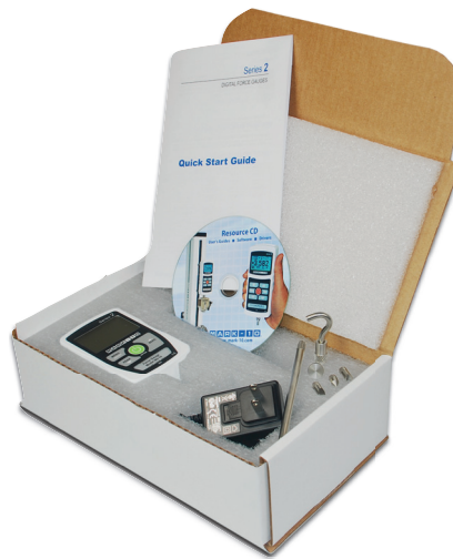
< Shown with the included cushioned shipping carton and optional accessories

The gauges are overload protected to 200% of capacity. An ergonomic, reversible aluminum housing allows for hand held use or fixture mounting, rugged enough for applications in both production and laboratory environments. Series 2 gauges are directly compatible with Mark-10 test stands and grips.