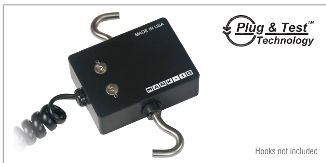
Hooks not included

Series R03 smart sensors are designed for tension and compression measurement applications in virtually every industry. Threaded holes on two sides can accept a variety of hooks and implements, making this sensor particularly well suited for inline tests. A shortened cable is available for mounting to an ESM1500LC, ESM303H, or ESM303 test stand (when equipped with optional AC1062 mounting kit*). Capacities available from 0.25 to 100 lbf [1 to 500 N]. Compatible with Mark-10 indicators (sold separately) through unique Plug & Test™ technology.