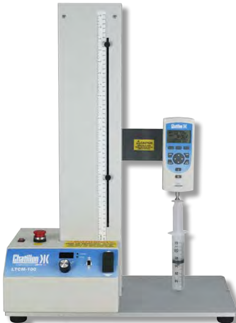
Shown: LTCM100 Series with optional DFS Series force gauge.