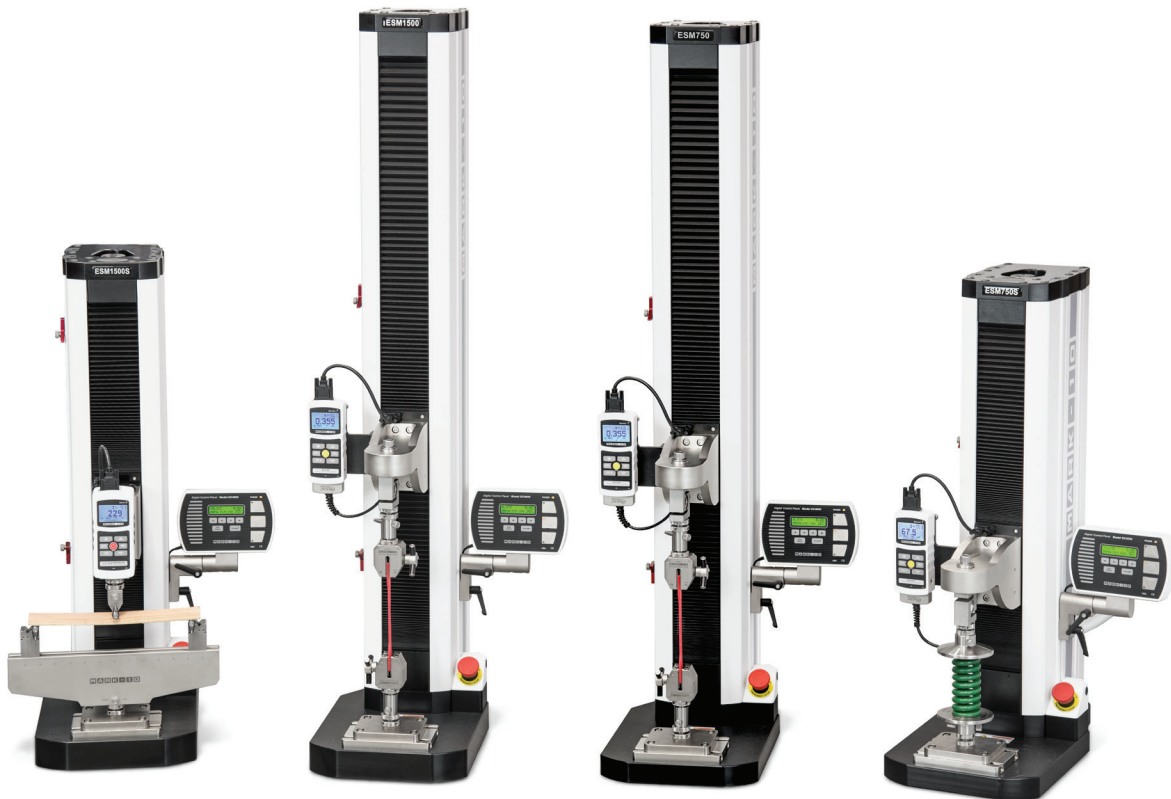
ESM1500S 1,500 lbf [6.7 kN] 14.2 in [360 mm] travel