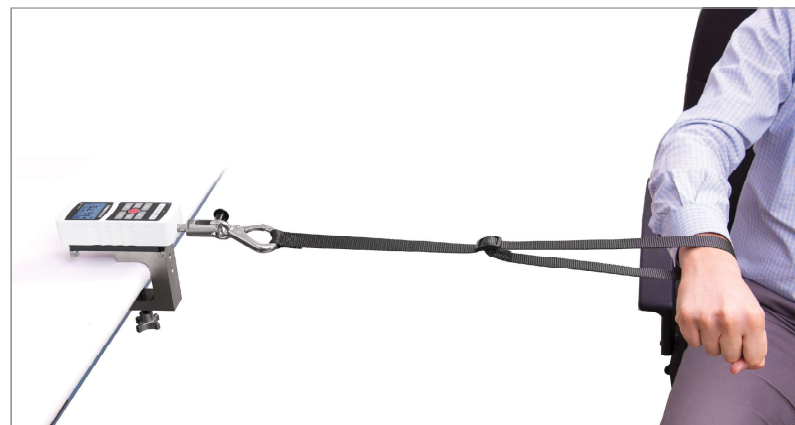
Force gauge shown in a horizontal orientation