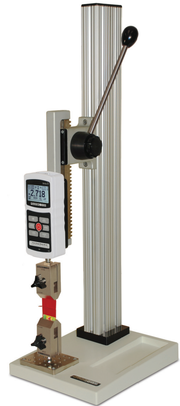
The TSB100 is shown with a Series 5 force gauge and G1008 film & paper grips