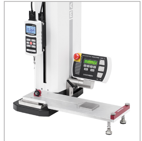
Shown with an ESM303 test stand and G1086 COF fixture

The M5-2-COF may also be used for a number of common tension and compression testing applications. The gauge is based on Mark-10's Series 5 advanced digital force gauges, and includes the series' full set of functions and settings.