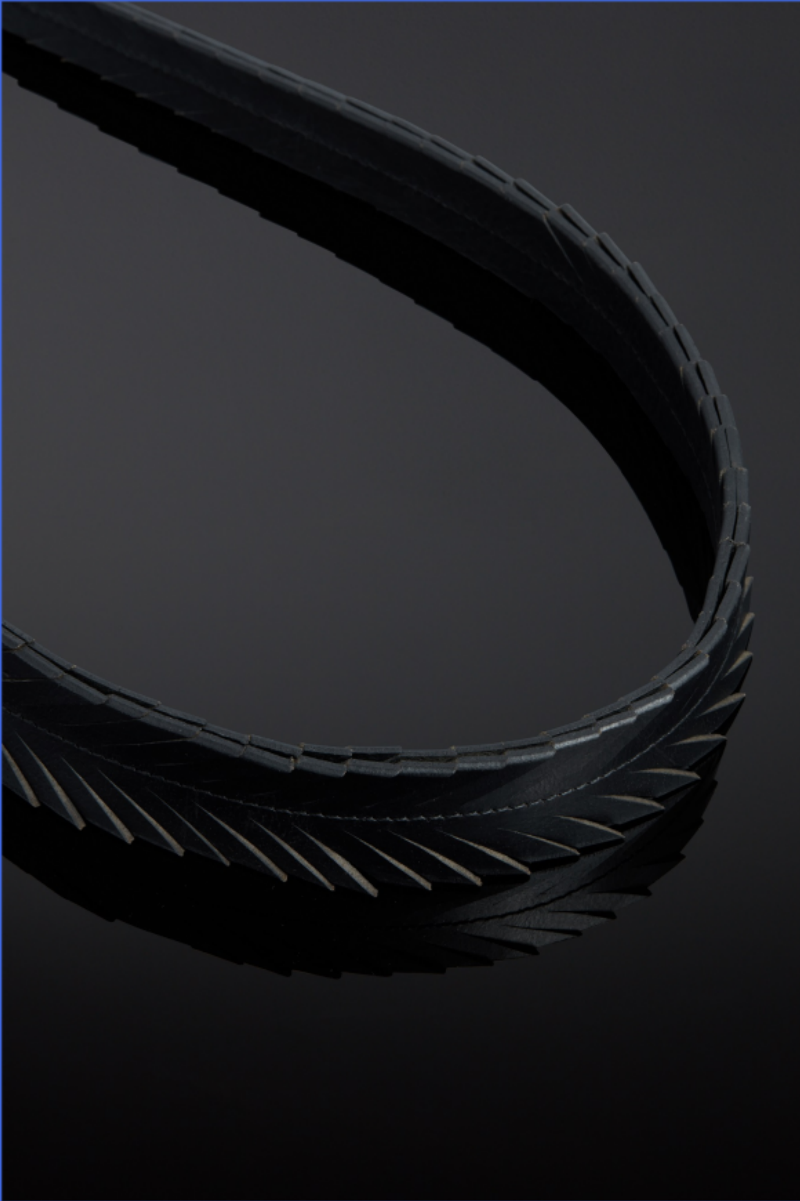
Pluma Feathered Leather Impact Tail