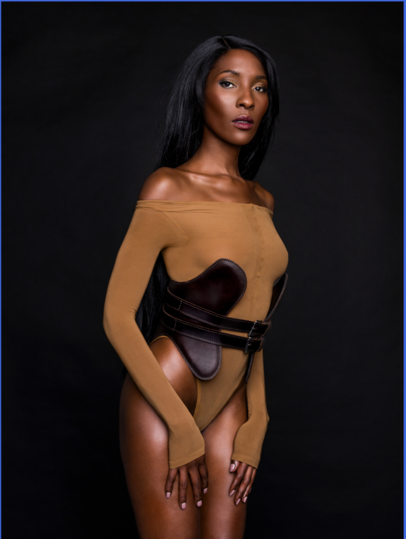
Sella Saddle Leather Waist Cincher