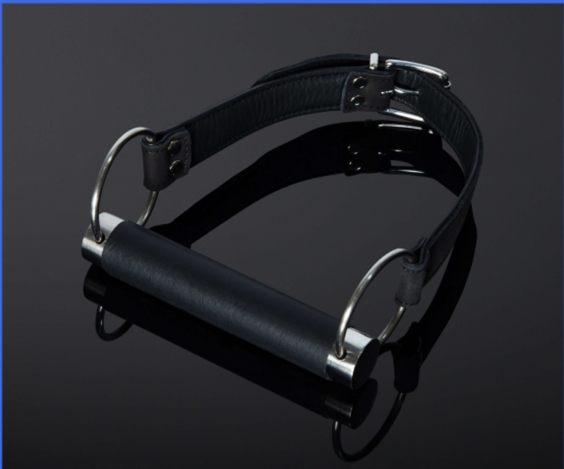
Sphaera Leather Bit Gag

The House of SXN is the exclusive designer of luxurious leather erotic wear and accessories. Infusing classic design with modern crafting techniques, all pieces are unparalleled in eroticism, form, and function. The ultimate in superior fetish wear all within your reach.