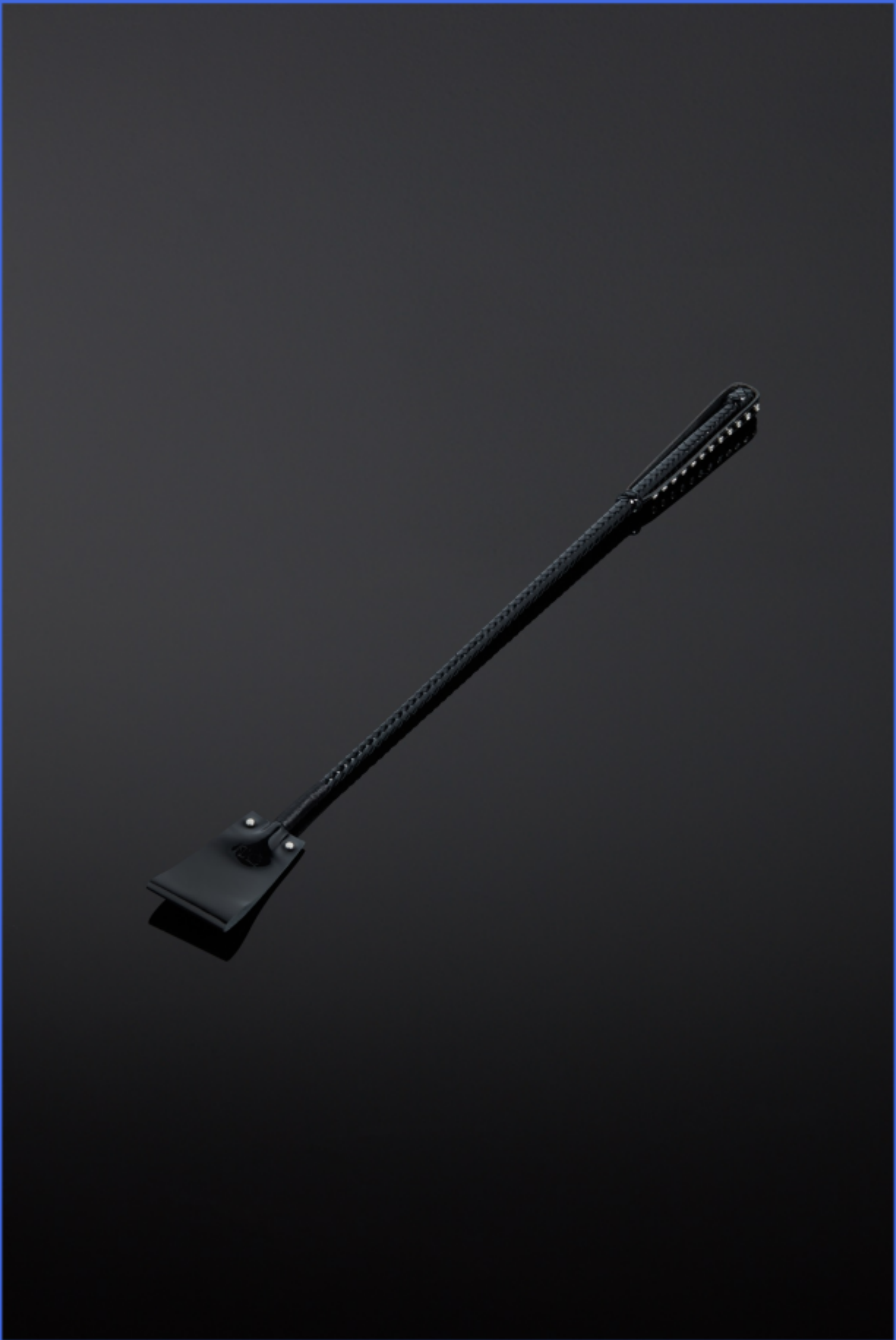
Pristinum Patent Leather Crop