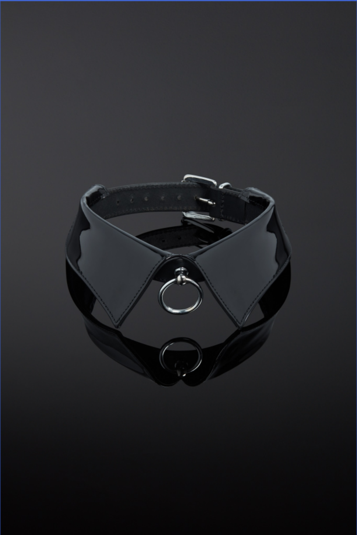
Pristinum Black Patent Leather Collar