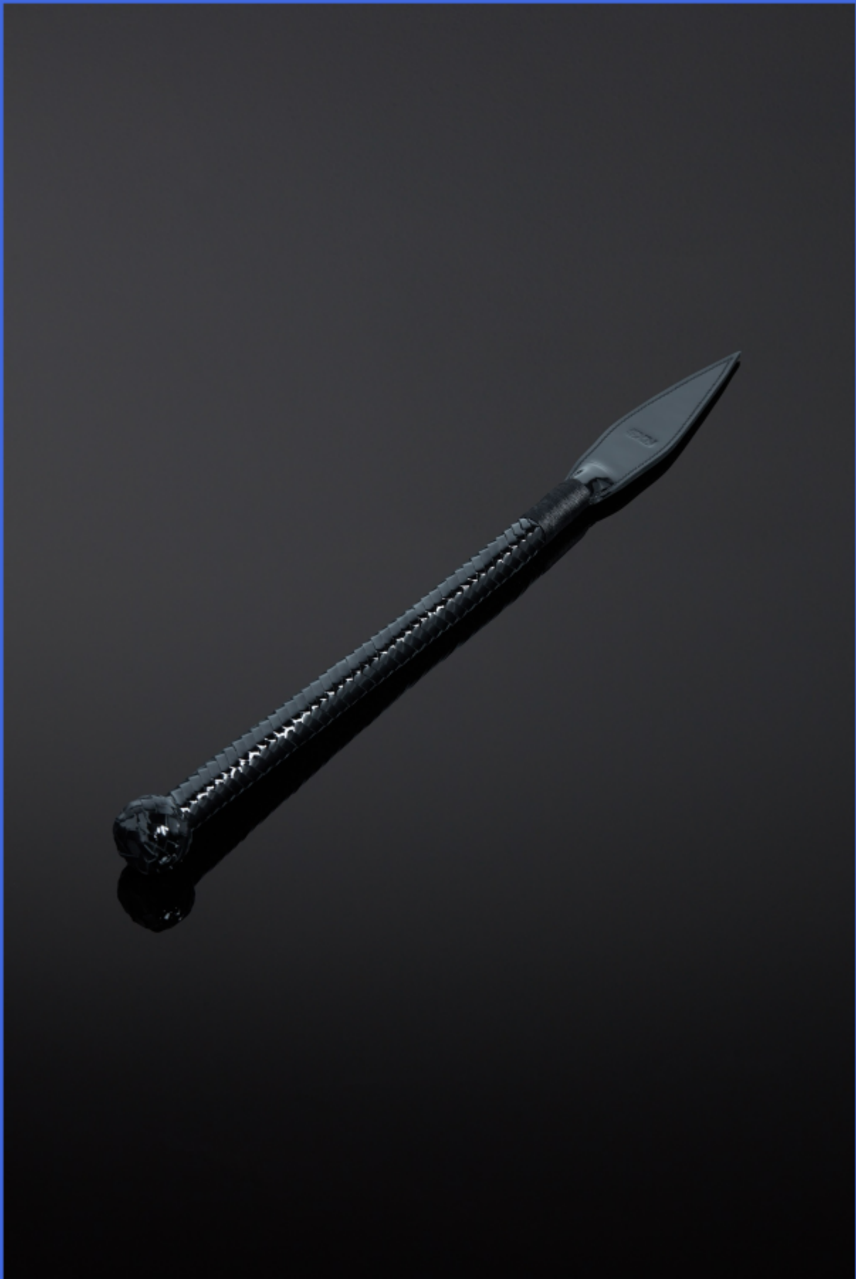
Brutalis Impact Tail