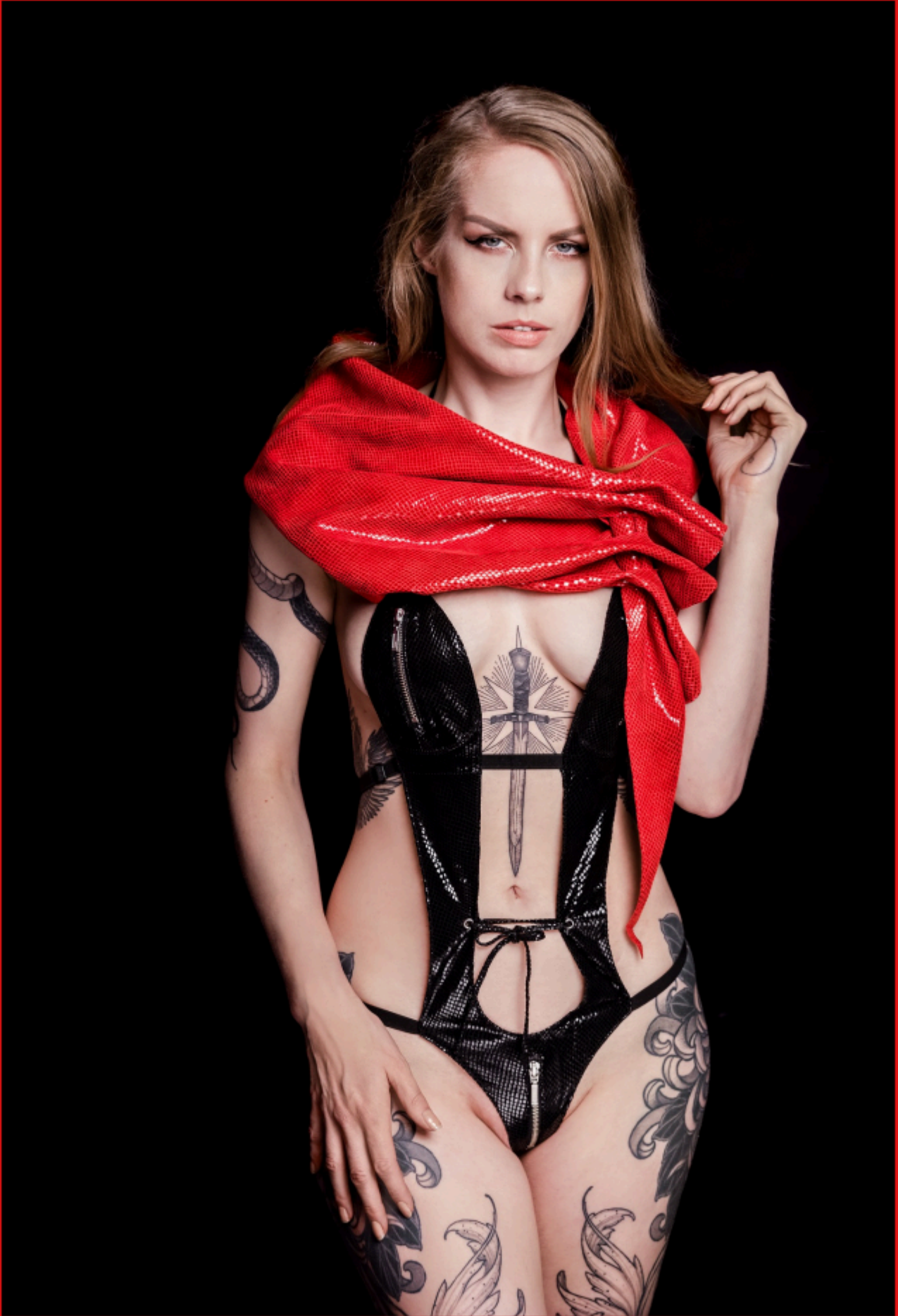
Serpens Stola Leather Covering