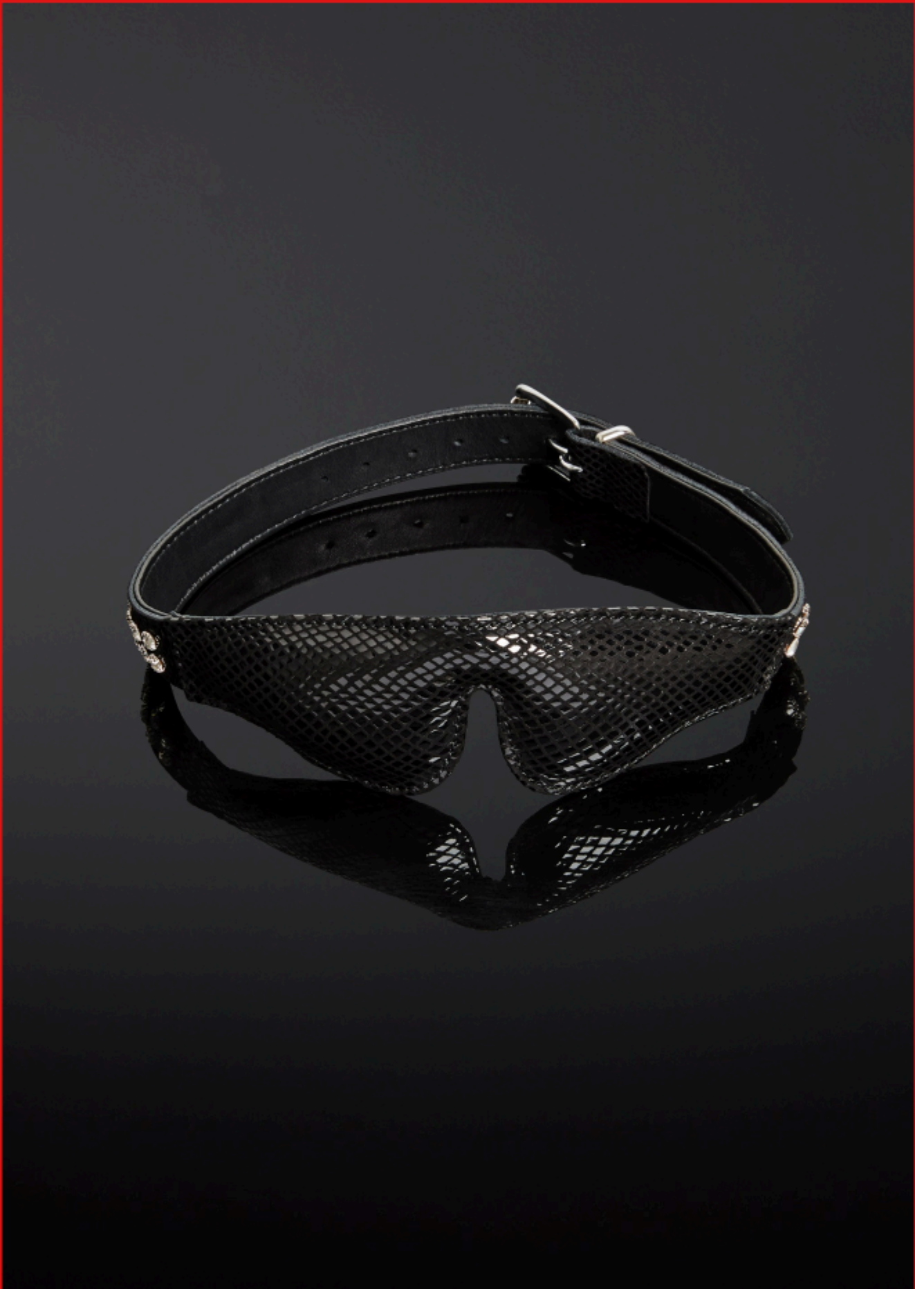
Serpens Gem Blindfold