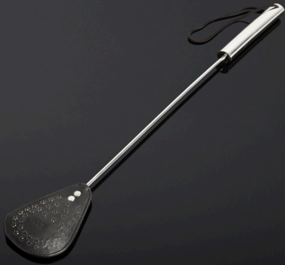
Serpens Vampire Crop