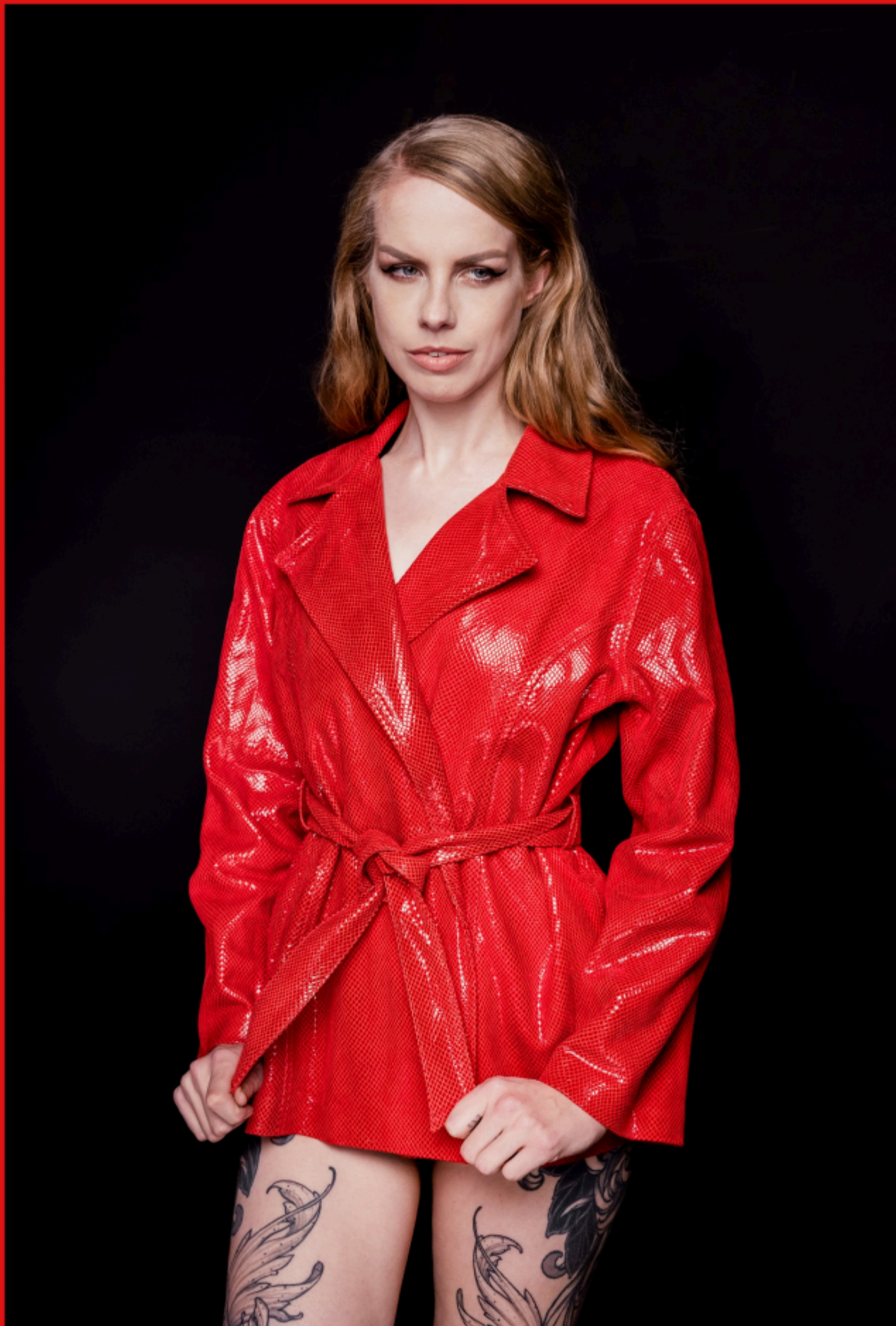
Serpens Red Leather Coat