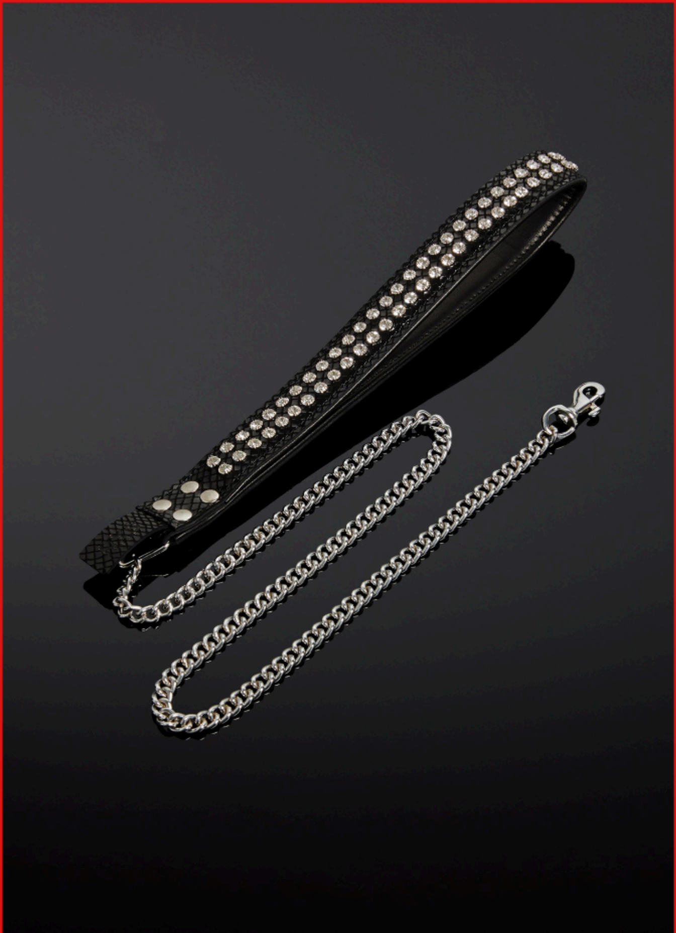
Serpens Gem Leash