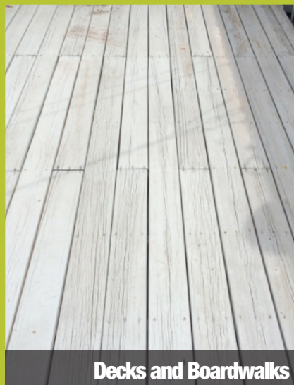
Decks and Boardwalks