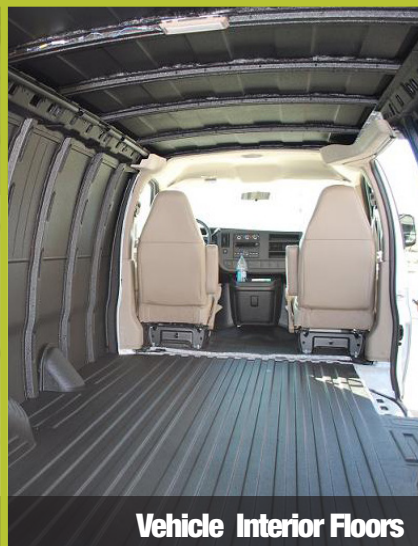
Vehicle Interior Floors