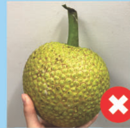
Stem not clipped