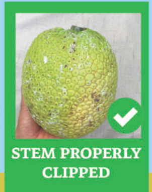
STEM PROPERLY CLIPPED