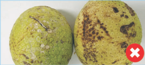
Bruised and lacerated fruit

Try to avoid letting fruit hit the ground to prevent bruising. Ensure fruit is not cut by picker blade as deep lacerations are not acceptable. Visibly diseased or significantly damaged fruit does not meet food safety standards and will not be accepted .