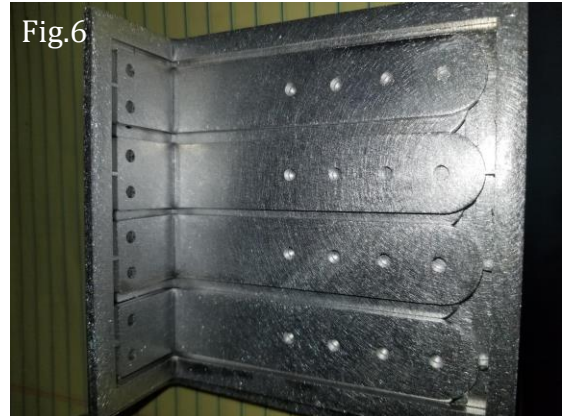
Fig. 6) along with pre-drilled mounting points located on the Chaser ring which will allow for multiple mounting points. Start by mounting your assembled Chaser ring to the back side of your brake dust shield. Find a suitable location to mount your rings. Loosely assemble the brackets to the Chaser wheel ring by mounting the brackets to the Chaser Ring and hand tightening with the supplied M3 X 8mm bolts and nylock nuts as seen in (Fig. 7) Keep in mind you will be using the provided

Your Chaser Wheel kit includes total of (16) brackets, (4 brackets shown in