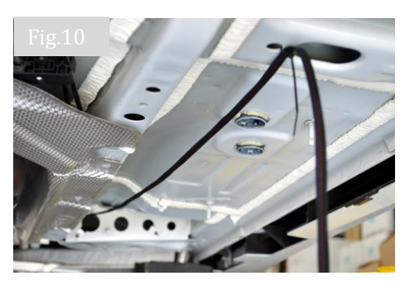
Page | 4

Connect chaser LED strips with the 4 included extension cables. When routing the LED leads, be sure to keep them away from heat, and moving parts. Use supplied zip ties to secure the leads to the underside of the vehicle (Fig. 10). Route the leads into the vehicle interior. Reinstall wheel and check for ring clearance. Repeat above steps on all other