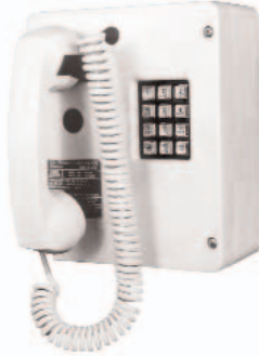
246-001 Indoor Phone