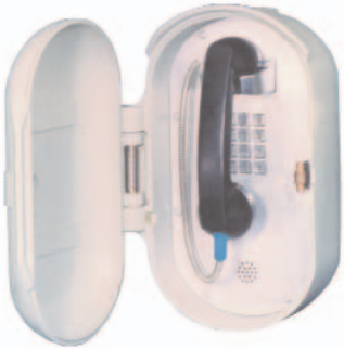
226-001 Tough Phone