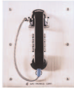
276-001 Flush Panel Phone