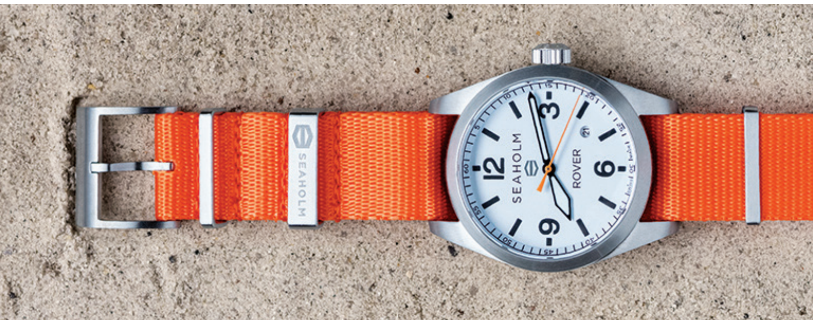
SEAHOLM ROVER FIELD WATCH WITH SEAHOLM ORANGE NATO STRAP