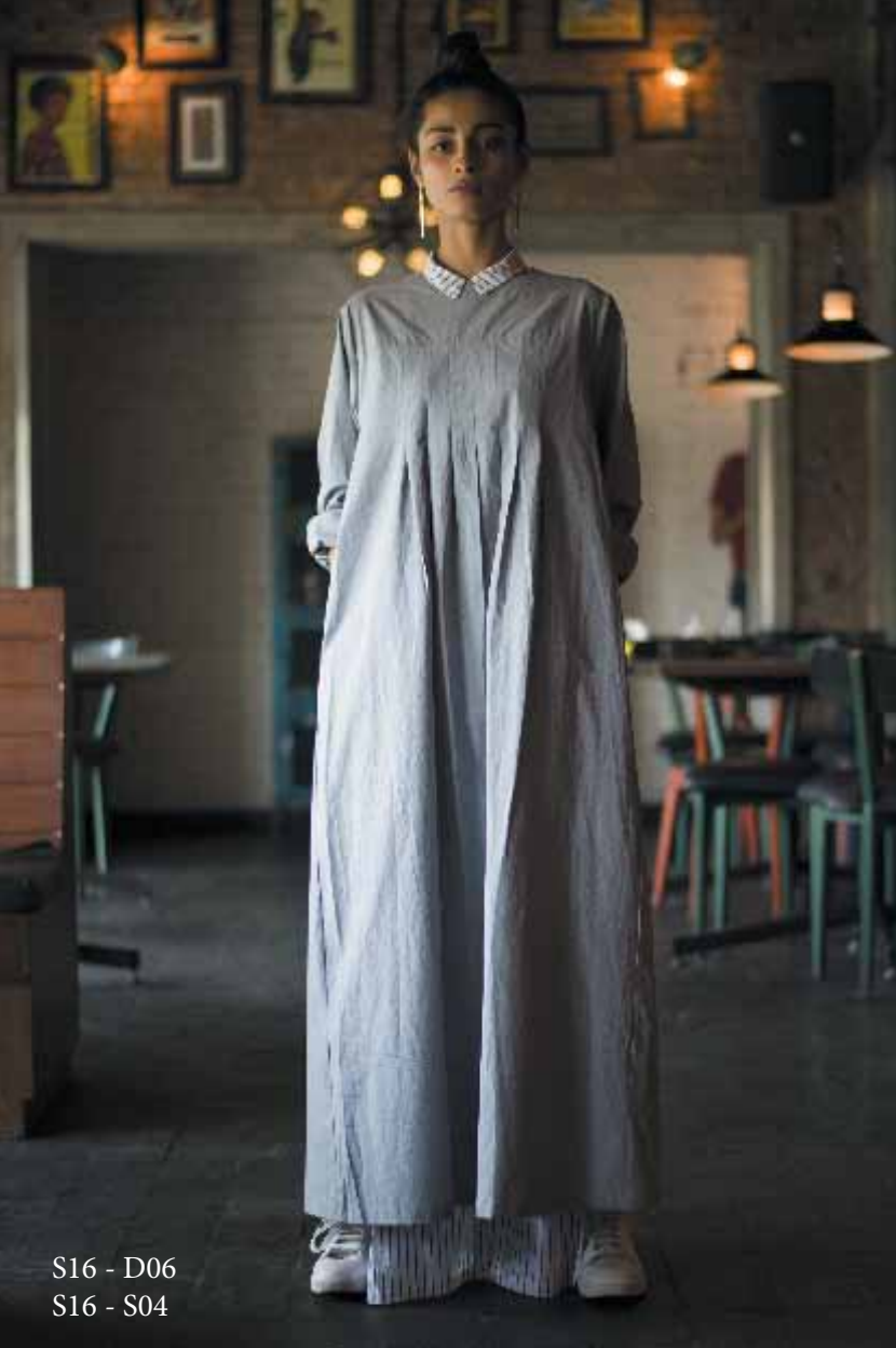
S16 - D06 S16 - S04