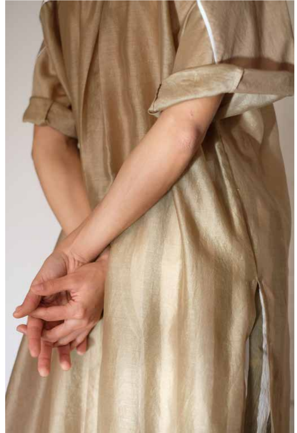
AW19-S04 DOLMAN SLEEVE SHIRT AW19-B06 BROAD BOTTOM