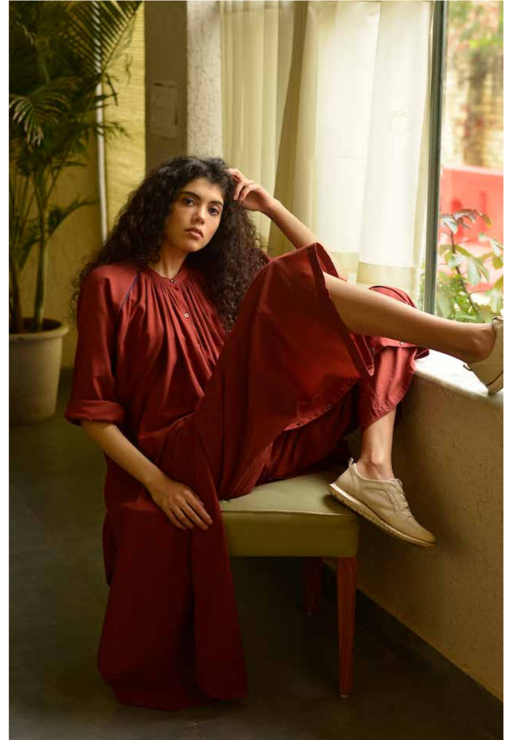
AW19-S01 GATHER NECK DRESS AW19-B15 BROAD BOTTOM