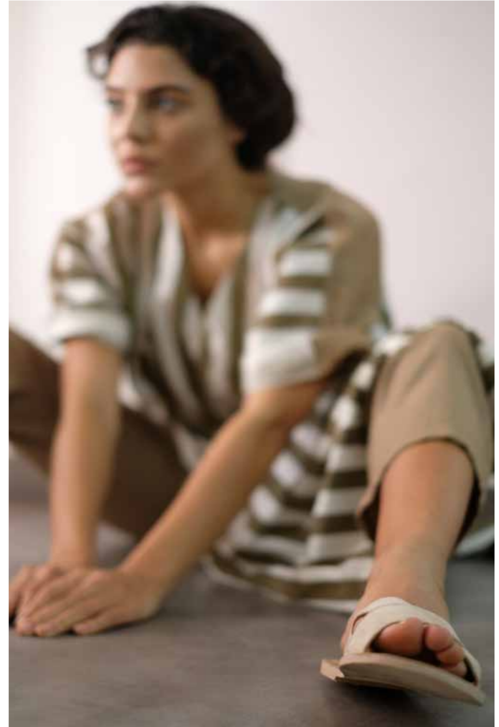
AW19-S06 V NECK KAFTAN AW19-B01 NEW NARROW BOTTOM