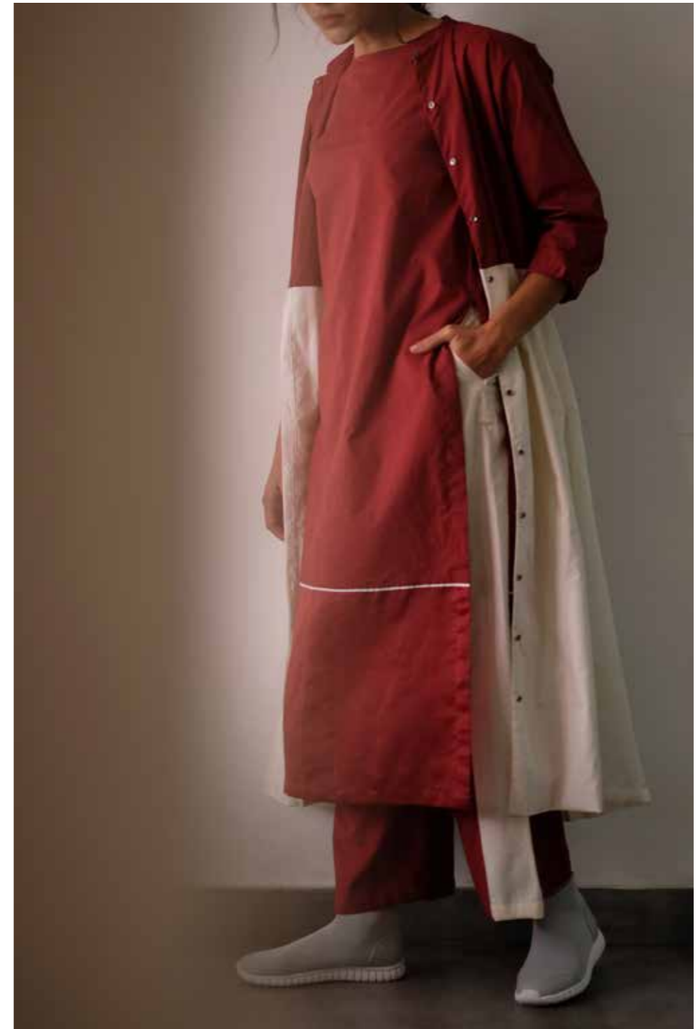
AW19-J04 BACK PLEAT JACKET AW19-S15 HIGH SLIT KURTA AW19-B02 HIGH WAIST PANEL PANT