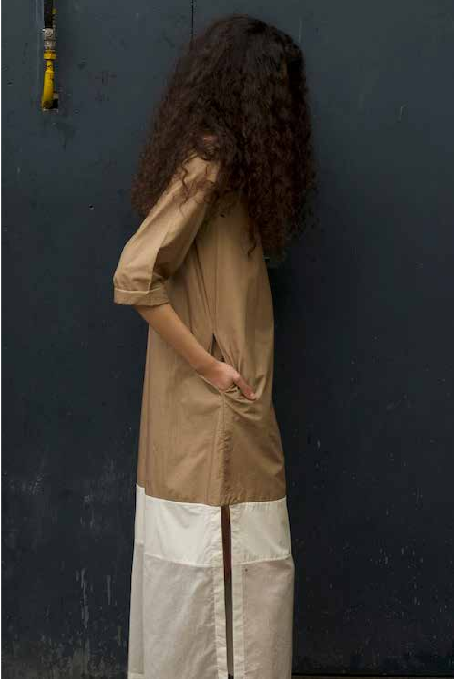
AW19-D05 TIER DRESS- SAGE