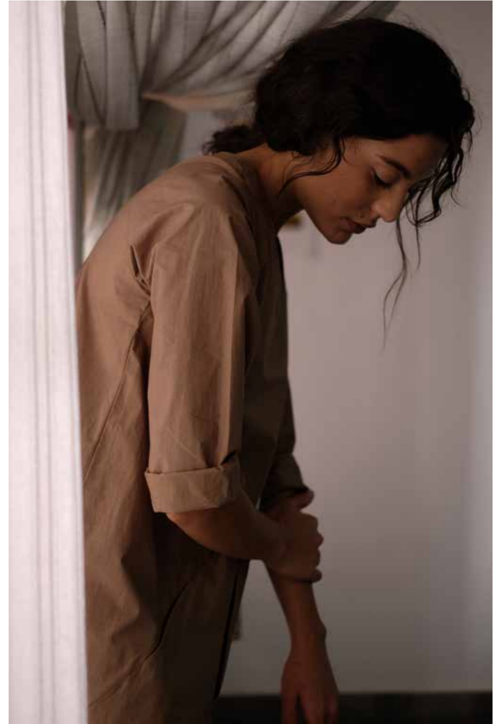
AW19-D01 TRIANGLE DRESS